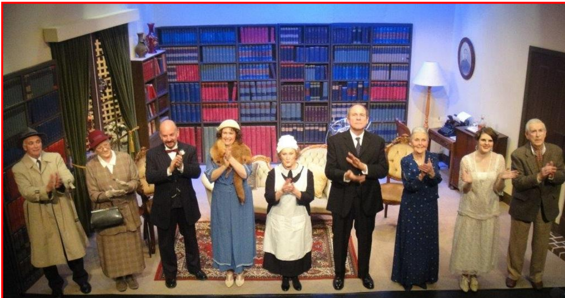
Sherbrooke Theatre Company

[Sap, Miss Mary Mead, Grey-Cells, Agatha, Pimms, Archie, Lavinia, Elvira, Dithering]