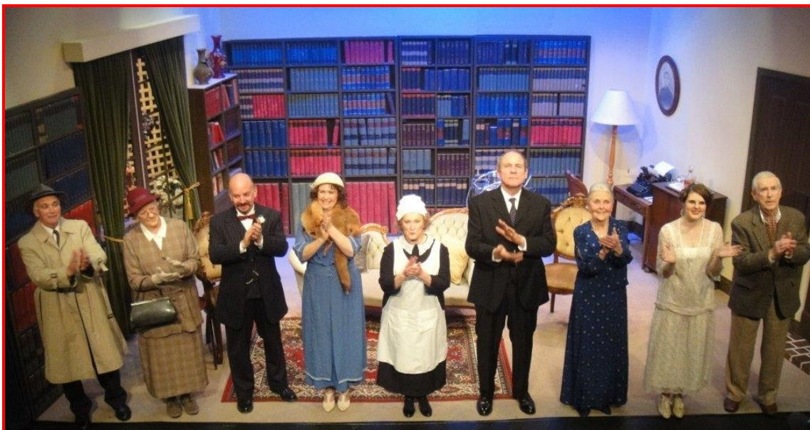
Sherbrooke Theatre Company

[Sap, Miss Mary Mead, Grey-Cells, Agatha, Pimms, Archie, Lavinia, Elvira, Dithering]