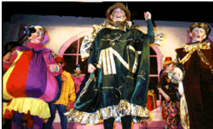
St Brendan's PS Lakes Entrance