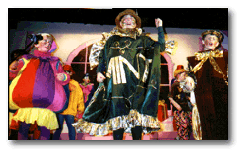
St Brendan's PS Lakes Entrance